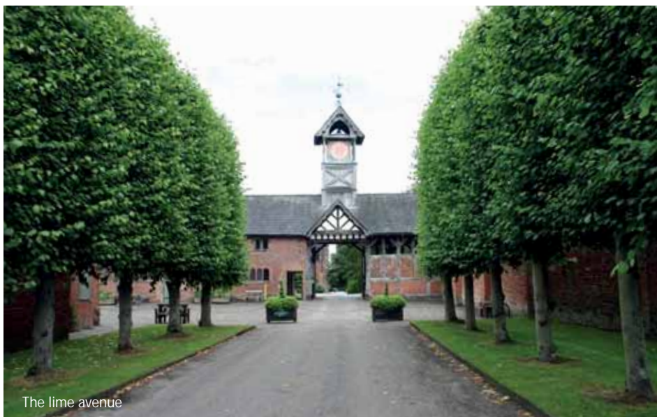
The lime avenue

We are a diverse site here and there's little we don't have, and I love the volunteers to learn and develop, even if they don't wish to become a gardener