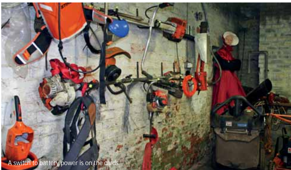
A switch to battery power is on the cards

Erected in the 1800s, the building houses fig trees, currently replete with ripening fruit that are just as old. "Charles loves them,"