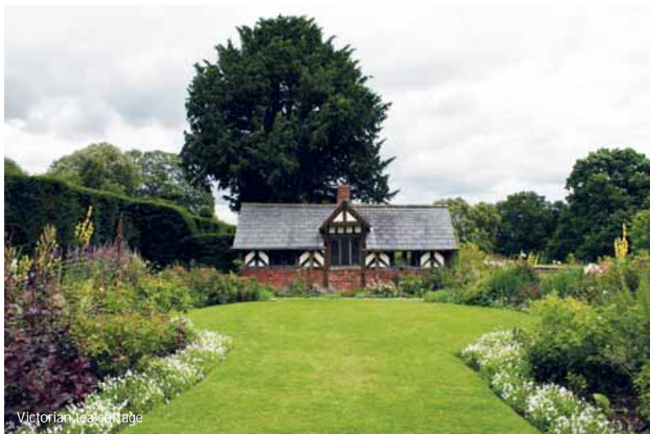
Victorian tea cottage

We have records of what goes where and when, and that's important with more than 230 varieties of flower clustered either side of the lush green-turfed central walk