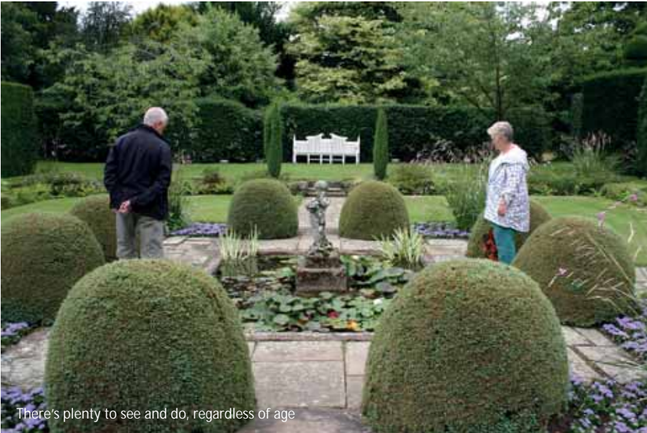
There's plenty to see and do, regardless of age