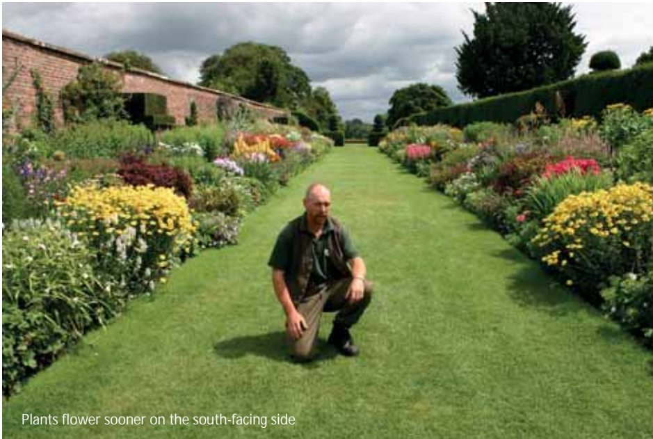
Plants flower sooner on the south-facing side

That's rare Diascia , native to South Africa. Carol Kline mentioned it when she presented from Chelsea a few years before. We had it a bit before that