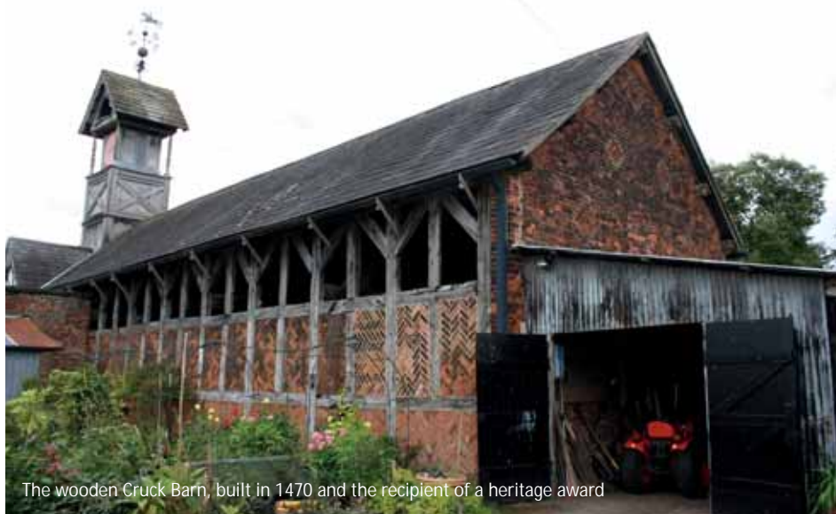
The wooden Cruck Barn, built in 1470 and the recipient of a heritage award

It caused quite a stir at the time. I'm a Scottish nationalist and up for electrifying Hadrian's Wall!