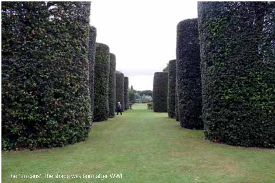
The 'tin cans'. The shape was born after WWI

The team have all been trained to build the 8m high scaffold required to trim each of the fourteen living structures - usually at the end of June