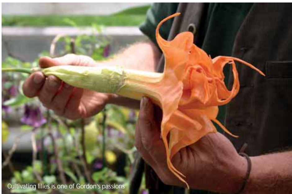
Cultivating lilies is one of Gordon's passions

I'm a horti nerd and wanted to introduce some interesting varieties when I started working here