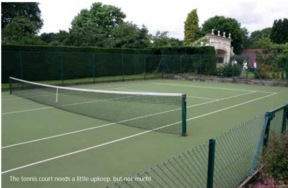
The tennis court needs a little upkeep, but not much!

"We use mains water on site, but try not